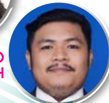
BASE MASSEANA WARUWU