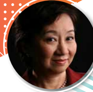
QUEK SOO HIANG Conductor Singapore