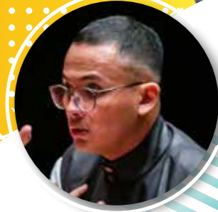
AGUSTINUS WAHYU PERMADI Conductor Indonesia