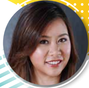
FU SHIHUA Conductor Singapore