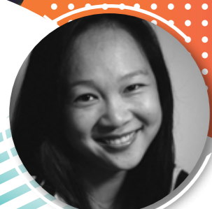
DAWN YIN Conductor Singapore