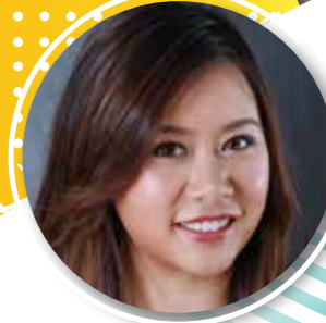
FU SHIHUA Conductor Singapore