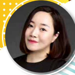
YANG JING Conductor