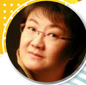
LIM BEE NA Conductor Singapore