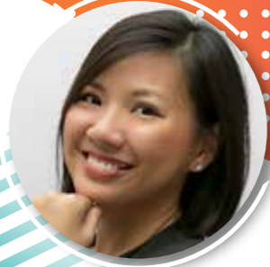
LEE WANRONG Conductor Singapore