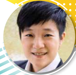
CHERIE CHAI Conductor Singapore